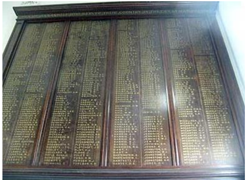
Annandale Roll of Honour WW1